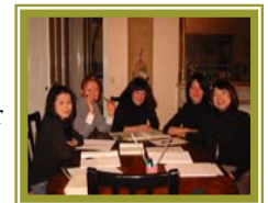
A group of Japanese students

T he 3 week session will help you make spectacular progress and experience first-hand French lifestyle and culture. A unique learning experience indeed! The one week session is aimed at improving a grammatical point or to prepare for a test or an entrance examination.